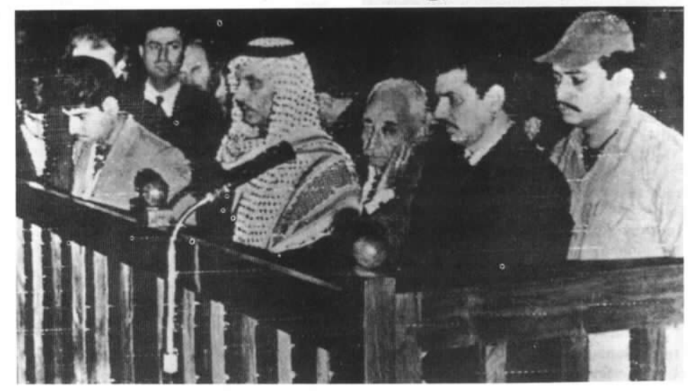
Above, the trial of the innocent Jews

25 years ago, in January 1969, the Baath regime of Iraq hanged 11 innocent Jews in Baghdad and Basrah to launch a reign of terror that was followed by the 10-year war with Iran, the invasion of Kuwait and the ostracization of Iraq by the world community. The nation that had 30 million date palm trees and a 20 billion dollar annual oil revenue, is now reduced to penury with not enough to eat, and with one million of its citizens in exile all over the world.