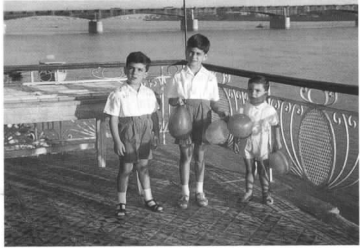
1956 - By the Rivers of Babylon. The new generation contemplates the future. In the background - the new Bridge●