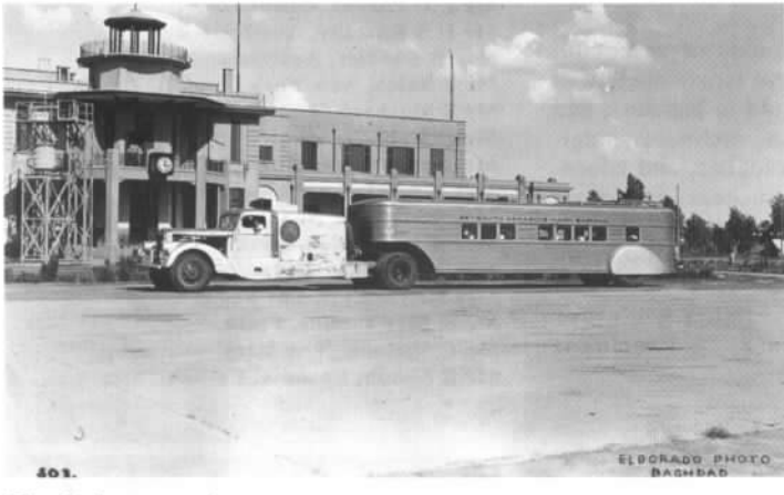
The Nairn trans-desert transport This service linking Baghdad and Damascus was established in the twenties by two New Zealander brothers