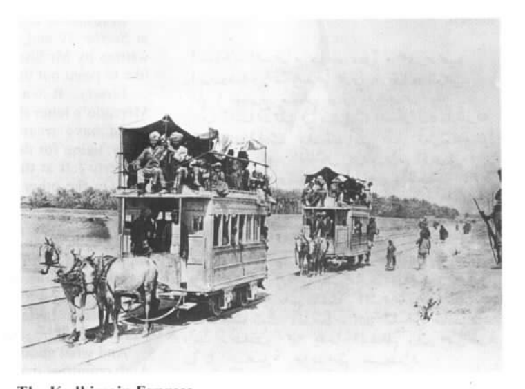
The Kadhimain Express 1917 - Indian troops on the 2-horsepower tramway linking Baghdad and Kadhumain with its Shiite shrines and golden minarets