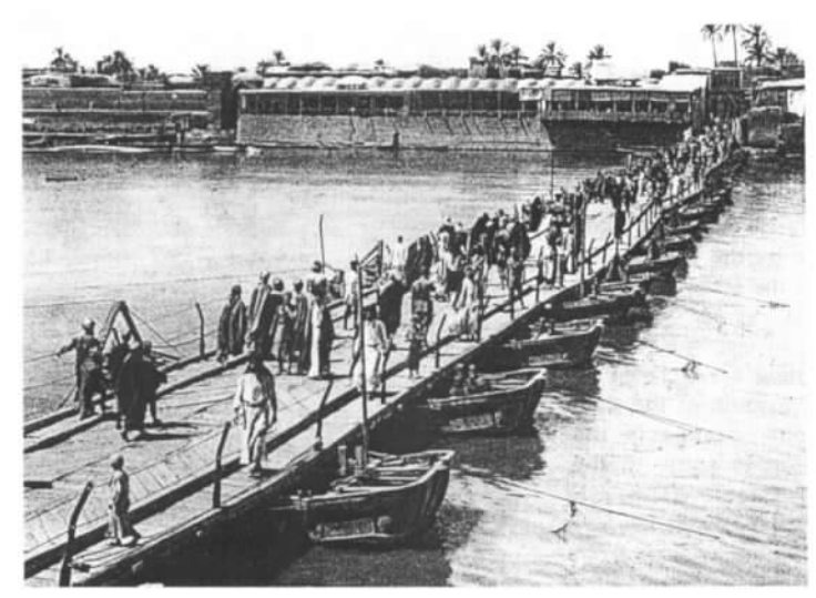
The old "Old" bridge